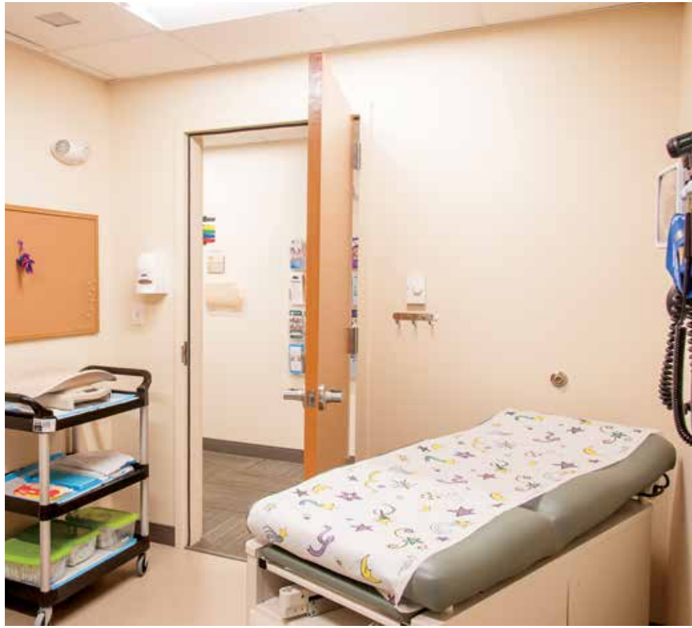
Clockwise from above: Children's corner in the waiting room. Pediatric exam room. Laboratory.