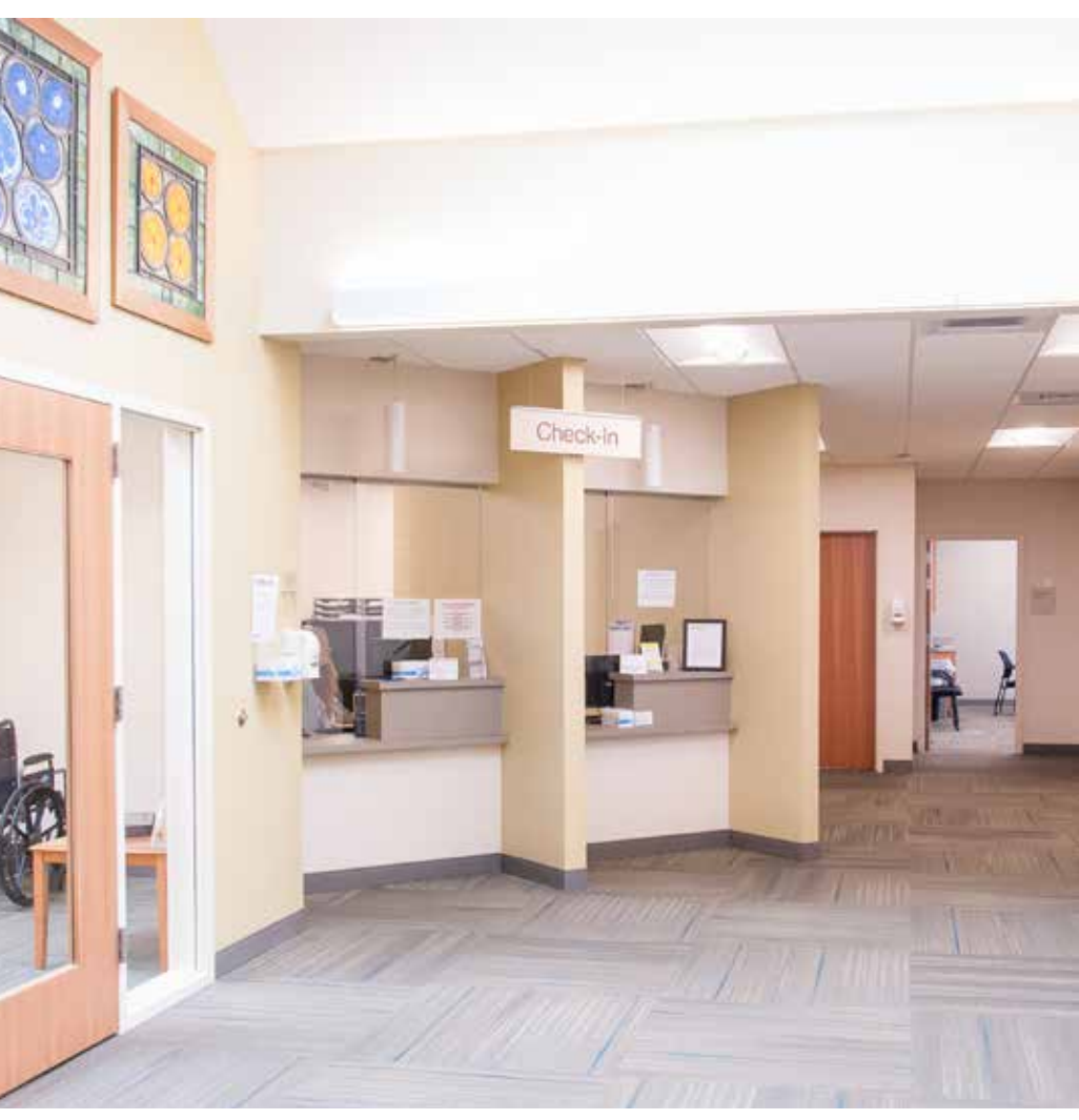
BY NANCY FONTAINE